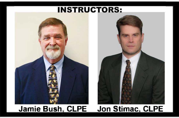
Visit www.RonSmithandAssociates.com for instructor bios

This symposium is designed for latent print examiners at all levels, from beginners to latent print supervisors who are required to Technically Review the work of their subordinates. If you know these techniques then fine, but if you don't, then it doesn't matter how much experience you have, you need to be in this class.